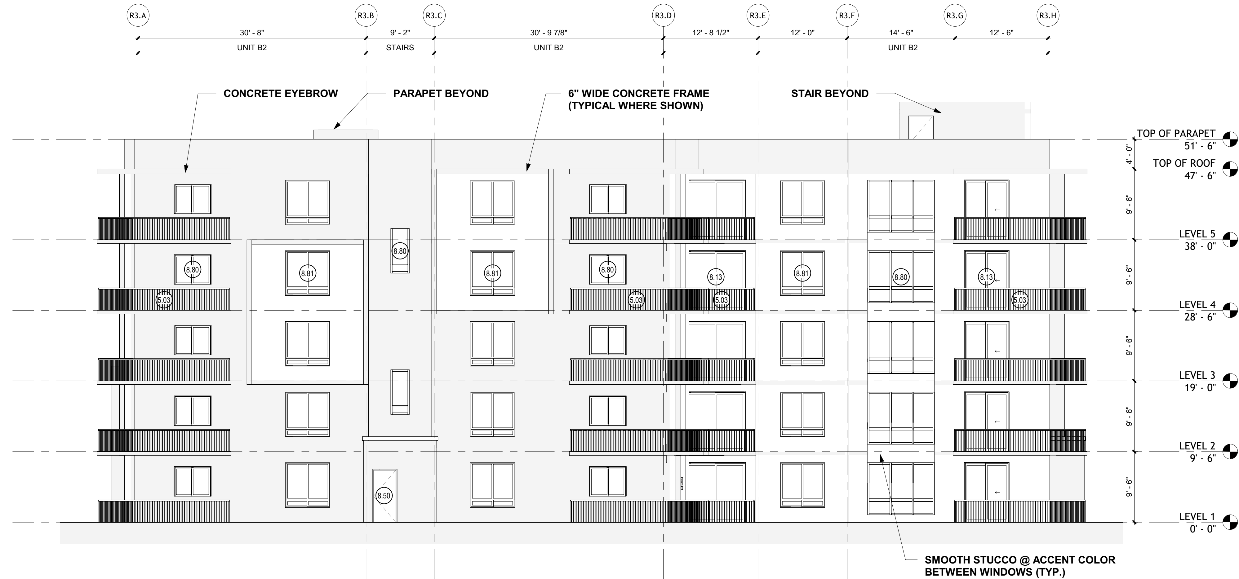
4 BUILDING #3 (WEST), #4 (NORTH) FACADE 1/8" = 1'-0"