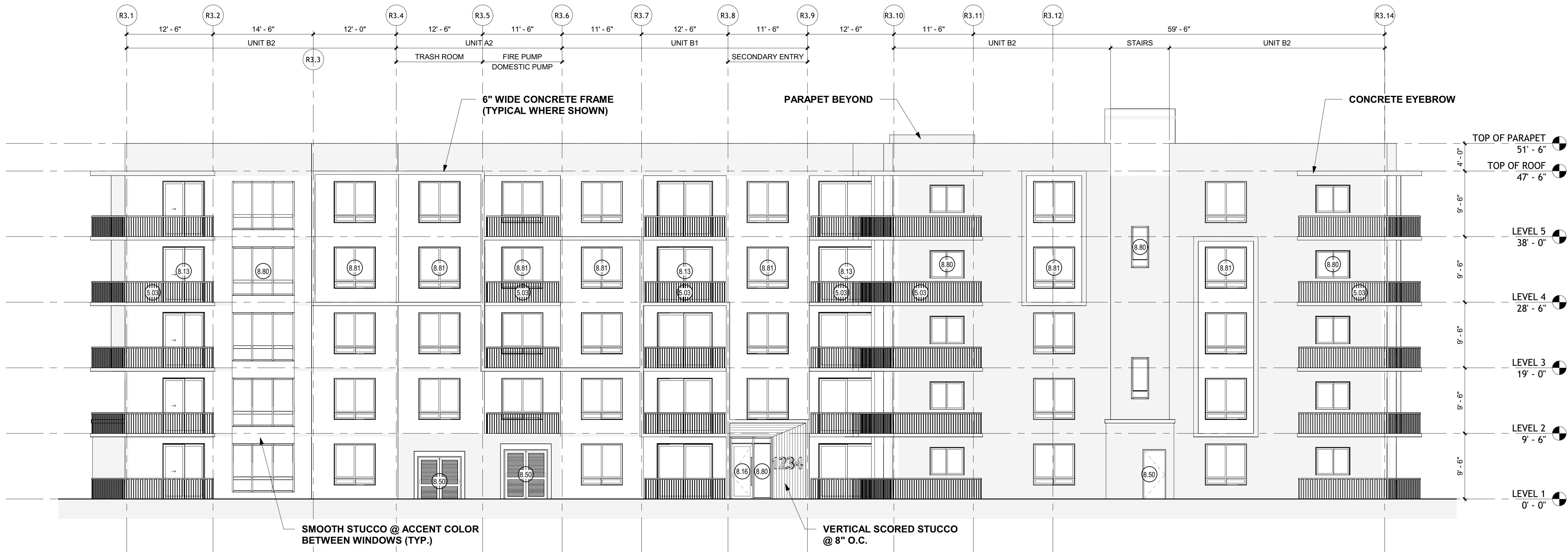
3 BUILDING #3 (SOUTH), #4 (WEST) FACADE 1/8" = 1'-0"